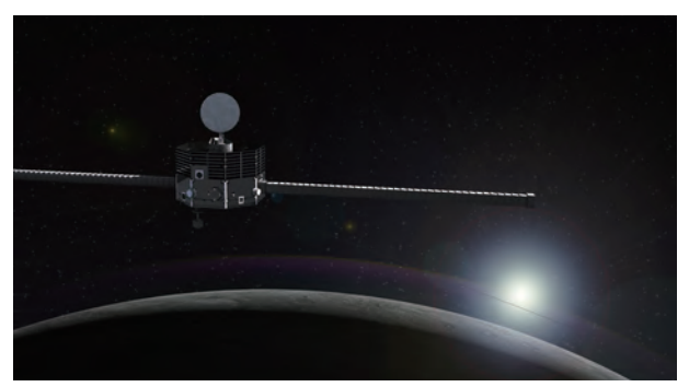
Mercury Magnetospheric Orbiter MIO

Report of JAXA Space Education Center On Its Activities in 2018-2019