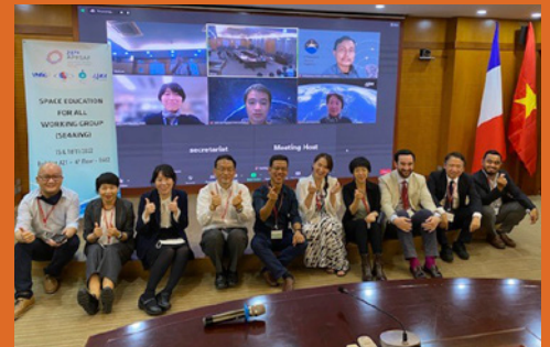
SE4AWG annual meeting takes place online and onsite.

The SE4AWG annual meeting is an exchange of information on educational activities and discussion on how to provide space education and training opportunities for all. Its scope of activities ranges from primary, secondary, and higher education to adult education by both formal and informal settings. SE4AWG has been holding the poster contest since 2006 toward the goal of increasing children’s interests and imaginations regarding their universe while showcasing the creative artwork of children of the Asia-Pacific region.