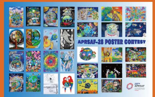
Students’ posters are displayed at the APRSAF annual meeting venue and on the APRSAF website.