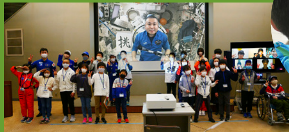
Astronaut Koichi WAKATA and the children who participated in JAXA Academy Kids.

The Space Education Center organizes a lecture series on STEM subjects. Selecting topics which carry crucial roles in resolving global issues, the JAXA Academy offers exciting opportunities for all those who are keen to learn about aerospace. One of the goals of SDGs (Sustainable Development Goals) is to provide educational opportunities for all (Goal 4). It is a very difficult task, but JAXA's Space Education Center connects people from diverse backgrounds through online teaching and learning. We will continue to expand our program in the coming years to all who share the desire to solve urgent global issues such as climate change.