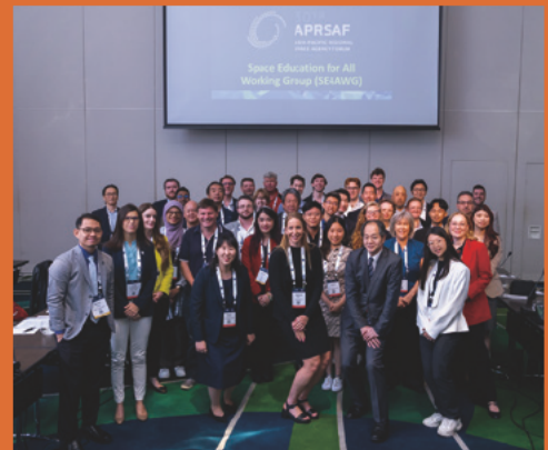
SE4AWG annual meeting takes place online and onsite.

SE4AWG has been holding the poster contest since 2006 toward the goal of increasing children’s interests and imaginations regarding their universe while showcasing the creative artwork of children of the Asia-Pacific region.