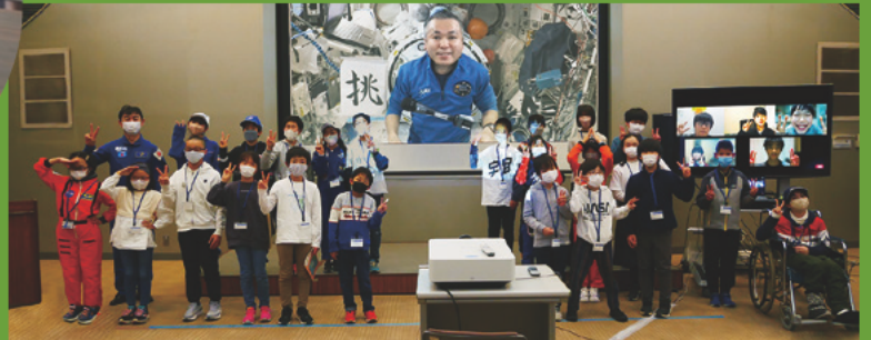
Astronaut Koichi WAKATA and the children who participated in JAXA Academy Kids.

Find more information on JAXA Space Education Center's social media.