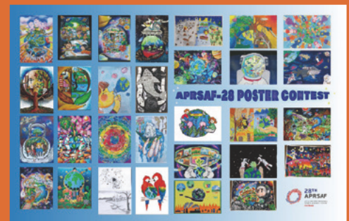
Students’ posters are displayed at the APRSAF annual meeting venue and on the APRSAF website.